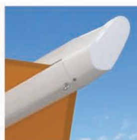
RAL powder coated

*Metal parts may be powder coated. RAL colours available.